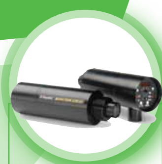
High Accuracy & High Temperature Pyrometers

BOPP & REUTHER MESSTECHNIK www.bopp-reuther.de