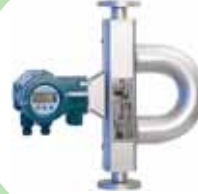
"Worlds smallest Mass Flow Meter"