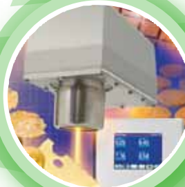
In-line Moisture Analysers