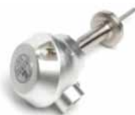
RTD Probes Sanitary