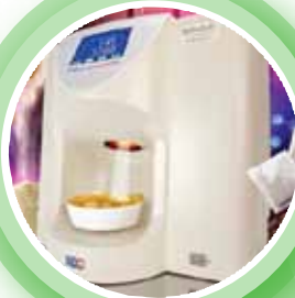
Infra Lab Moisture & Fat Analysers