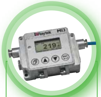
Compact Infra Red Thermometers