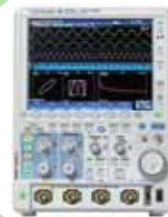
Digital Oscilloscopes/ Scopecorders