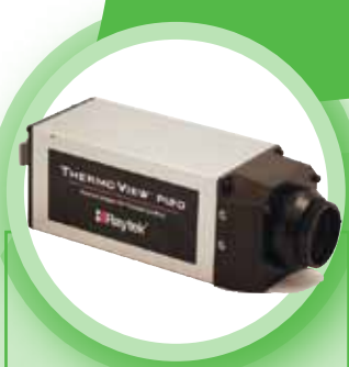
Thermal Scanners & Fixed Thermal Imagers