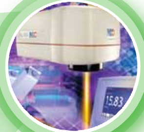
Coatings & Thickness Measurement