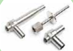
Sensor Components & Thermowells