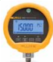
Digital Pressure Gauge