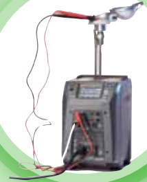
Oil Baths/ Dry Wells