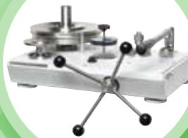
Dead Weight Testers