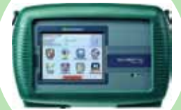
Portable Energy Metering