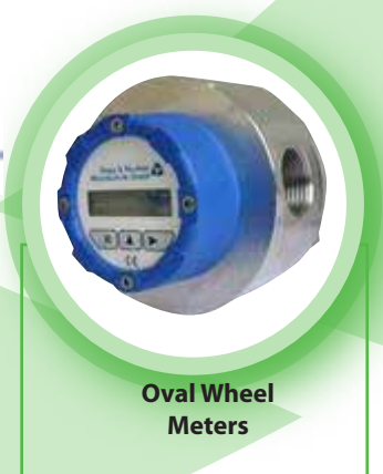
Oval Wheel Meters

BOPP & REUTHER MESSTECHNIK www.bopp-reuther.de