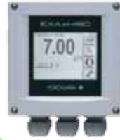
pH/Conductivity/Analysers Dissolved Oxygen