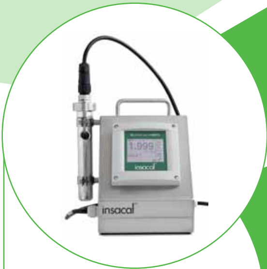
Insacal EXAxt 450