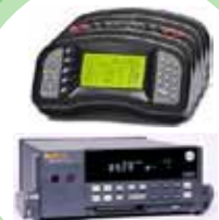
Fast Data Acquisition